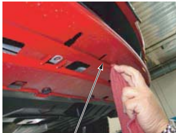
Clean the groove in the front bumper.