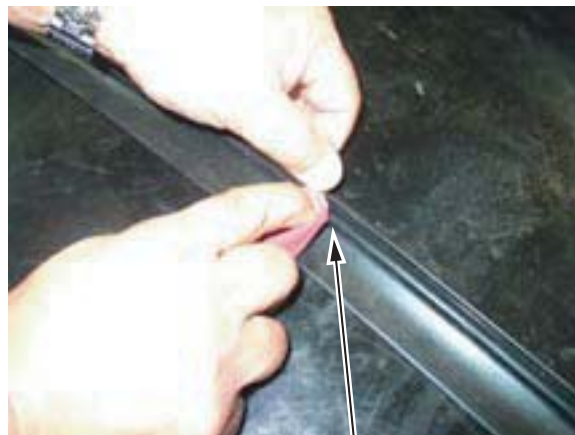
Clean the groove in the air spoiler